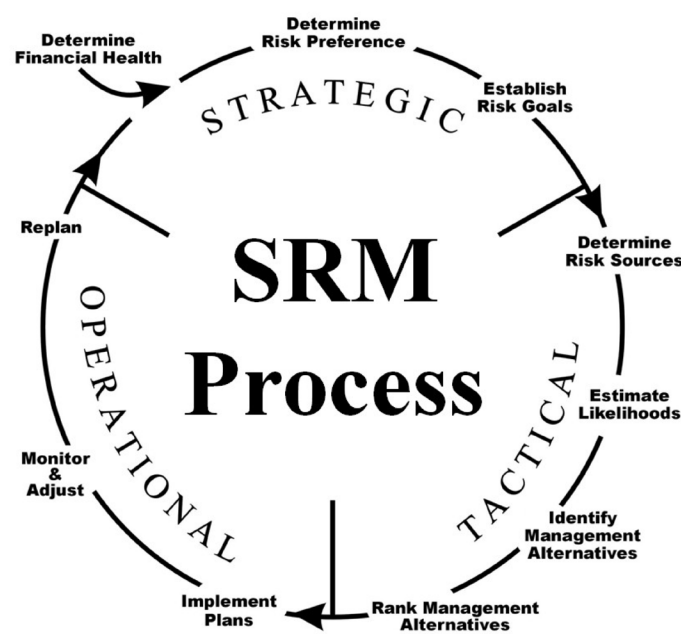
The Strategic Risk Management Process