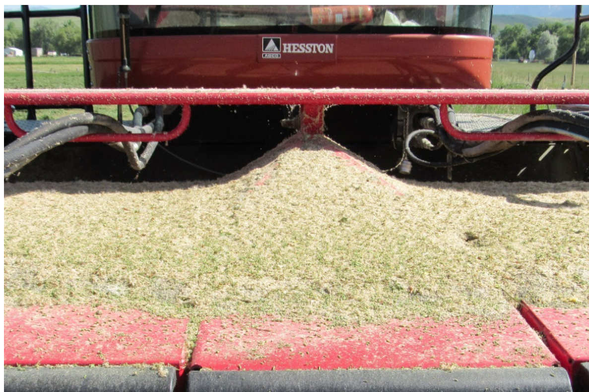
After harvesting a heavily infested field, this hay swather is crawling with light green alfalfa weevil larvae. Early harvest of the first cutting can kill larvae, but hay quantity and quality are affected. If eight or more larvae per square foot of hay stubble survive harvest, pesticide treatment is advised to protect the second cutting.