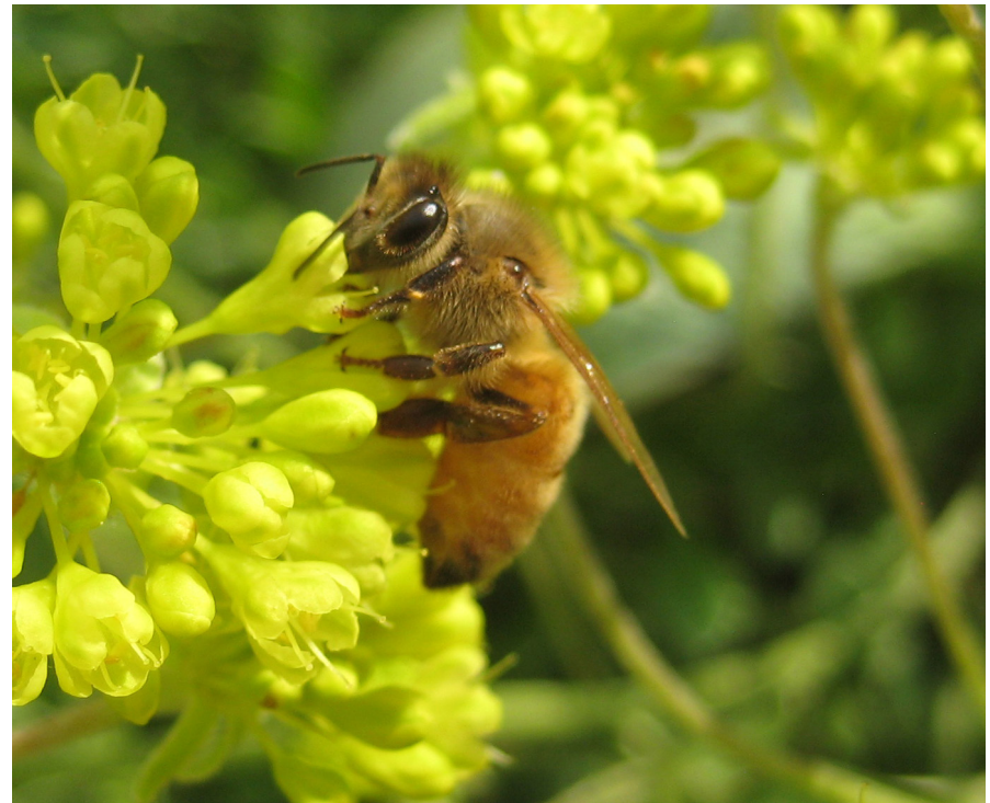
Honey bee on native Kannah Creek sulfur buckwheat ( Eriogonum umbellatum )

Pollinators are the many animals, mostly insects, that visit flowers for rewards of nectar and pollen. As they move from flower to flower, they transfer pollen that creates fertile seeds for the next generation of plants.