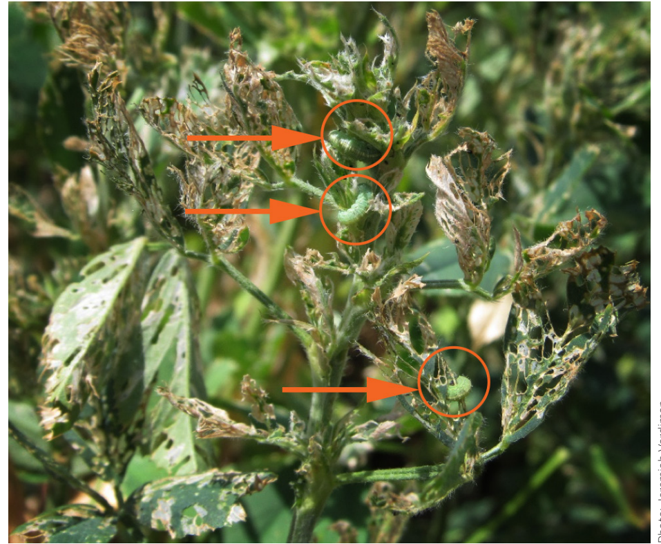
Arrows point to three third- and fourth-stage larvae. Black heads and pale stripes allow them to blend into the skeletonized foliage.

For example, with spring-deposited weevil eggs, the larvae should reach peak second instar at 425 degree-days. The GDD prediction tool will make